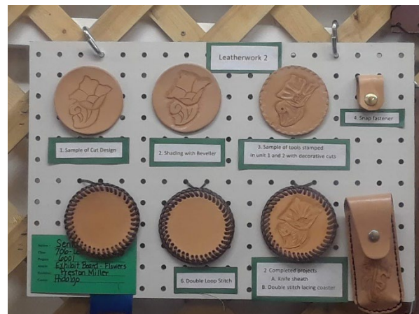
Leather II Practice board Examples